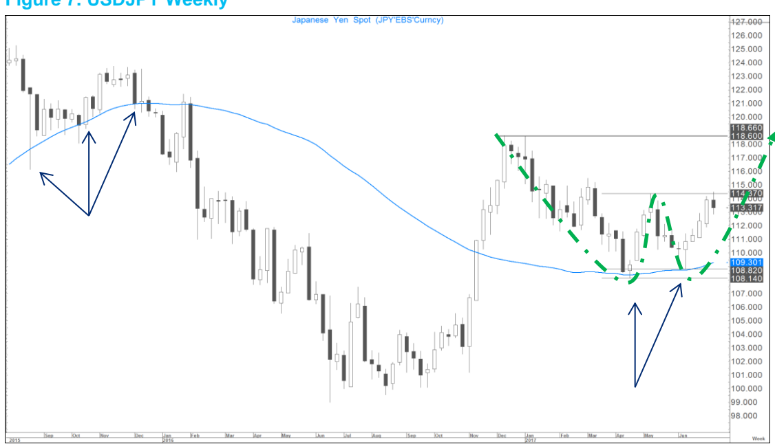
Figure 7. USDJPY Weekly